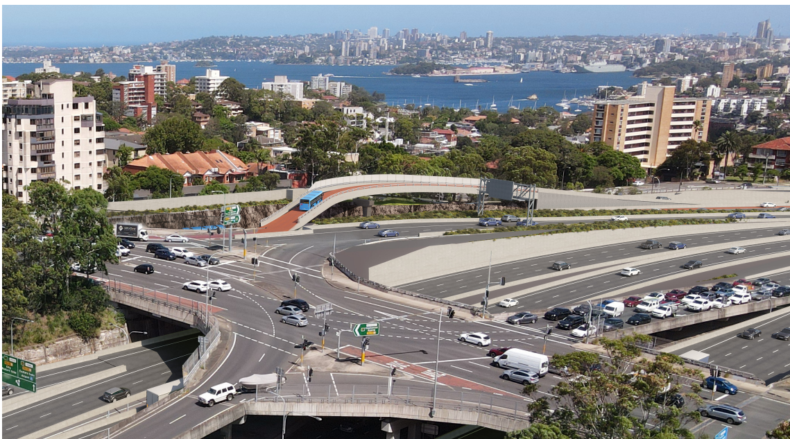
Artist's impression of the future Falcon Street southbound bus on ramp, south-east view of the Warringah Freeway and Falcon Street bridge

To safely enable this work, including partial demolition of the existing Falcon Street bridge, freeway widening and bus on ramp construction, we will be establishing temporary work areas on Falcon Street and on the eastern side of the Warringah Freeway, south of Falcon Street.