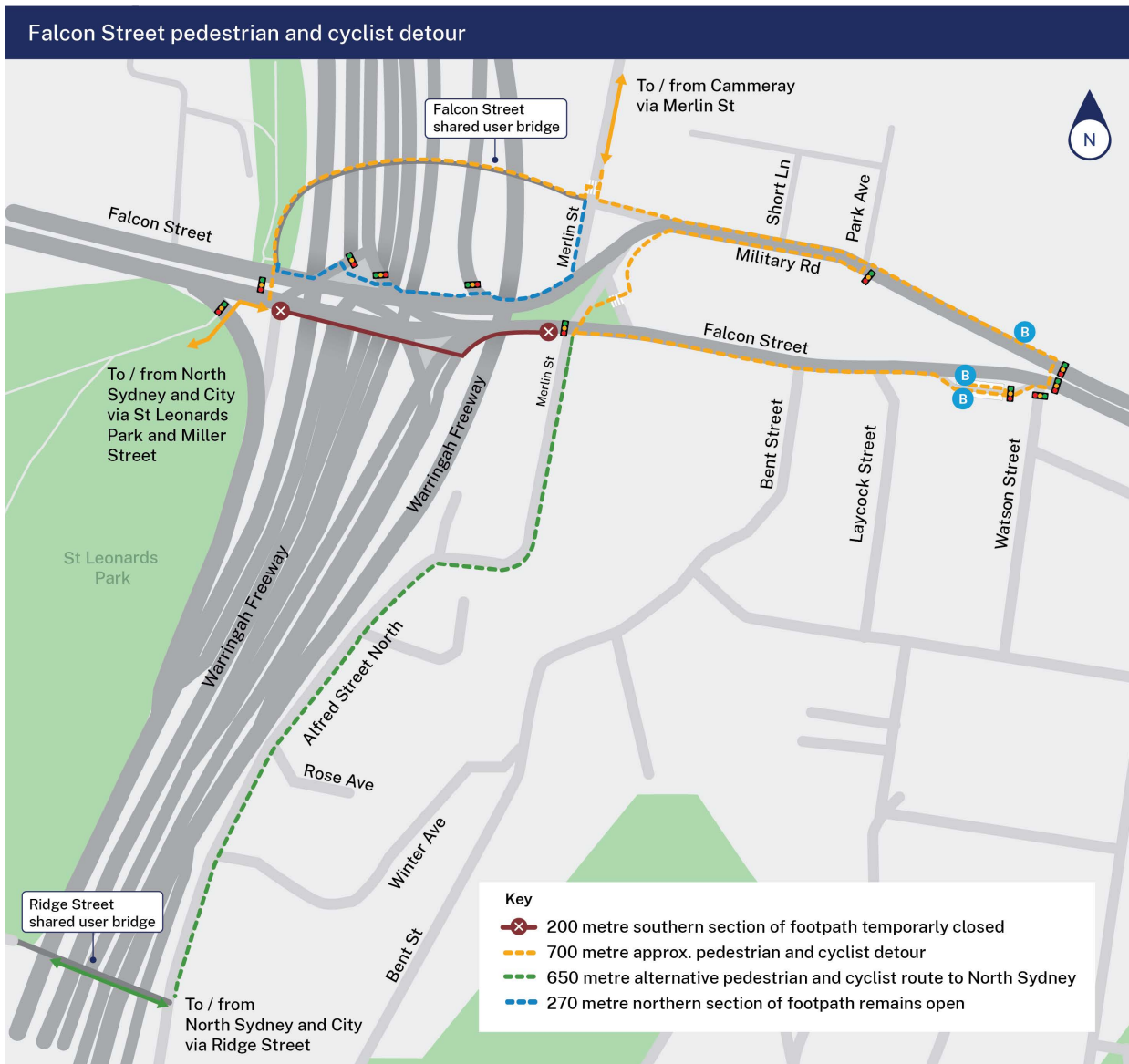
Falcon Street temporary footpath closure and detour map

Safety fencing, barriers and traffic control will be in place around the work area. Please slow down and use extra caution when traveling through the area and follow any cyclist dismount signage in place.